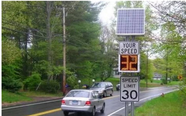
This driver feedback signs lets drivers know the speed they are traveling and can tell them to slow down.

Driver feedback signs show the current speed limit and the speed that a vehicle is traveling at the moment. These signs inform drivers of the speed that they are traveling and encourage them to drive the speed limit. These signs can be programmed to alert a driver that is traveling over the speed limit by flashing and or displaying a message.